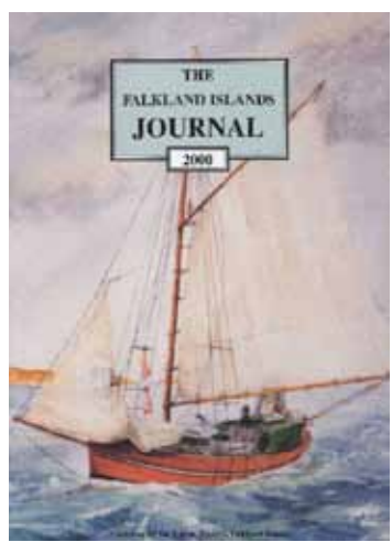
The first colour cover

The Journal is sold in the Falklands and distributed globally to a range of subscribers. This year, we